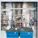
Ammonia recovery processes