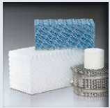
Structured packings for mass and heat transfer