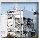
Combustion plants for the disposal of exhaust air, waste gases and liquid media