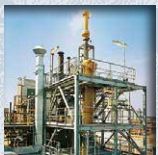
Turn-key units for waste gas scrubbing