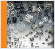
Tower packings for mass and heat transfer