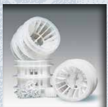
Biological carrier media