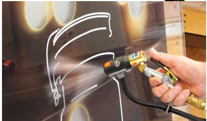
The Model 8293 Gen4 Ion Air Gun cleaning artwork and glass prior to framing.

The Gen4 Ion Air Gun is quiet, lightweight and features a hanger hook for easy storage. The 10 foot (3m) armored and electromagnetic shielded power cable is extremely flexible, designed for rugged industrial use.