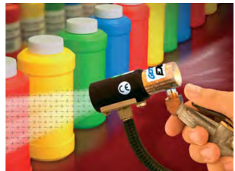
The Model 8293 Gen4 Ion Air Gun neutralizes and cleans plastic bottles prior to labeling.