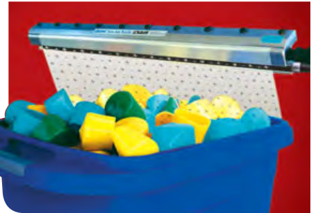
The Model 8218 18" (457mm) Gen4 Standard Ion Air Knife System showers parts with static eliminating ions to prevent personnel shocks.

Compressed air inlets are provided on each end of the Gen4 Standard Ion Air Knife. For long spans, multiple Gen4 Standard Ion Air Knives can be mounted end-to-end. This produces an air gap at the connection end of about 2" (51mm). (If no air gap is desired, use the Gen4 Super Ion Air Knife.) Special length Gen4 Ionizing Bars up to 119" (3.02m) are available for multiple air knife applications.