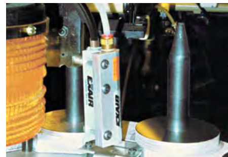
A Model 8103 3" (76mm) Gen4 Standard Ion Air Knife removes dust from computer hard disks prior to assembly.