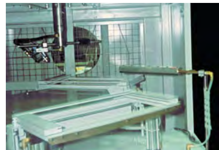
A Model 8212 12" (305mm) Gen4 Standard Ion Air Knife System cleans metal frames prior to powder coating.