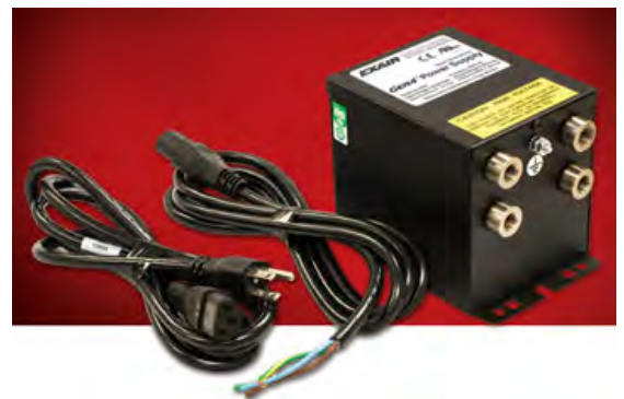
The Model 7961 Gen4 Power Supply has 115VAC or 230VAC selectable voltage, lighted power switch, integral fuse on the primary, electromagnetically shielded modular power cable and (4) 5kV outlets.