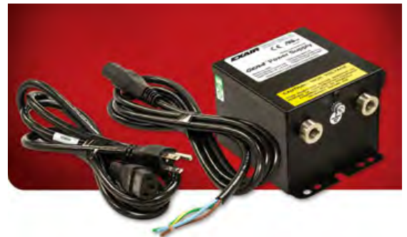
The Model 7960 Gen4 Power Supply has 115VAC or 230VAC selectable voltage, lighted power switch, integral fuse on the primary, electromagnetically shielded modular power cable and (2) 5kV outlets.

The Two and Four Outlet selectable voltage Gen4 Power Supplies require an input of 115VAC, 50/60 Hz or 230VAC, 50/60 Hz. A 6' (1.83m) modular power cord and lighted power switch are included. Power Supplies are UL Component Recognized to U.S. and Canadian safety standards, and are CE and RoHS compliant.