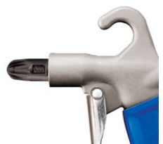
Model 1210-PEEK SG Safety Air Gun Nozzle: 1100T-PEEK Super Air Nozzle

The Model 1210SS uses the stainless steel Super Air Nozzle constructed of Type 316 stainless steel for rugged use and corrosion resistance.