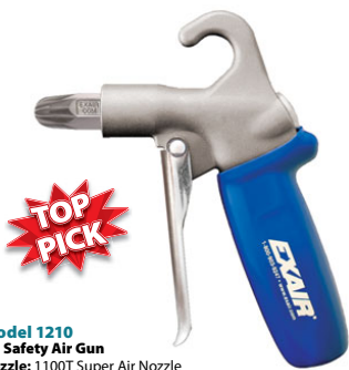
Model 1210 SG Safety Air Gun Nozzle: 1100T Super Air Nozzle