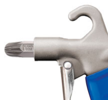
Model 1210SS SG Safety Air Gun Nozzle: 1100SST Super Air Nozzle

The Model 1210SS uses the stainless steel Super Air Nozzle constructed of Type 316 stainless steel for rugged use and corrosion resistance.